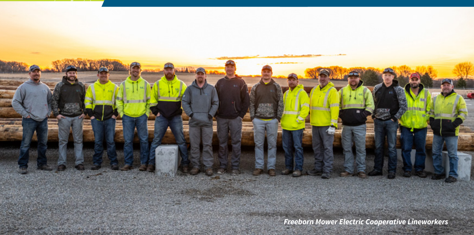
Freeborn Mower Electric Cooperative Lineworkers