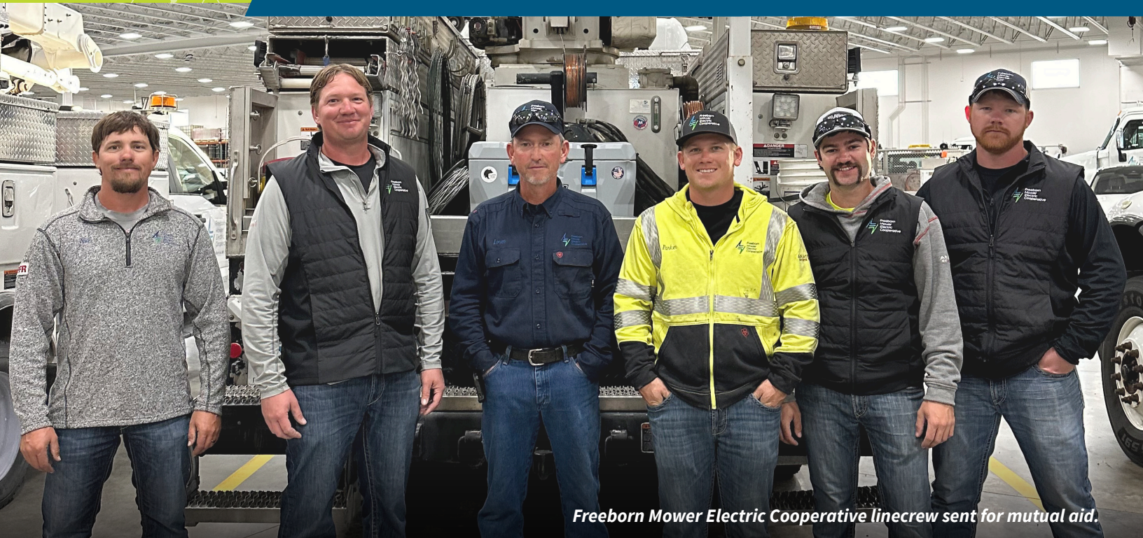
Freeborn Mower Electric Cooperative lineworker sent for mutual aid.