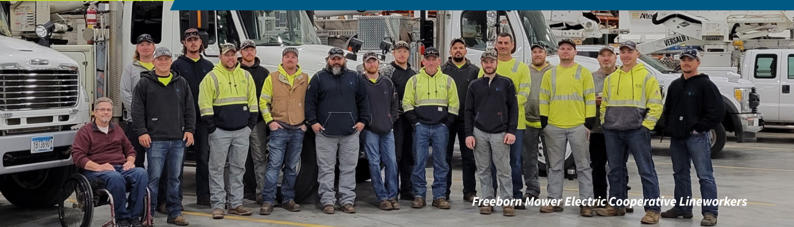
Freeborn Mower Electric Cooperative Lineworkers