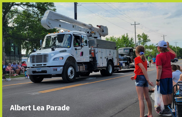
Albert Lea Parade