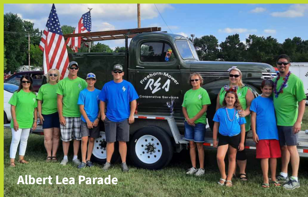
Albert Lea Parade