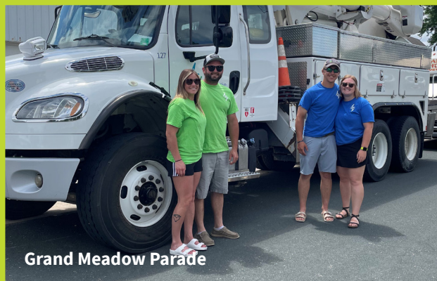
Grand Meadow Parade