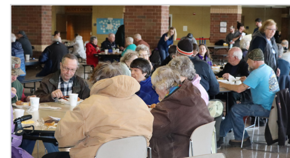
Members enjoyed breakfast prior to the Annual Meeting. Hy-Vee catered the meal, assisted by the Twin Lakes 4-H Club.