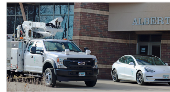
A FMEC truck and electric car were displayed.