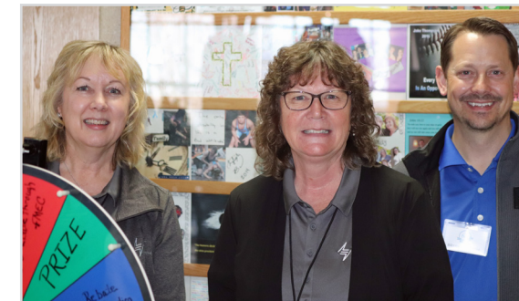
The Energy Solutions Team enjoyed visiting with members while playing the "Spin The Wheel" game.